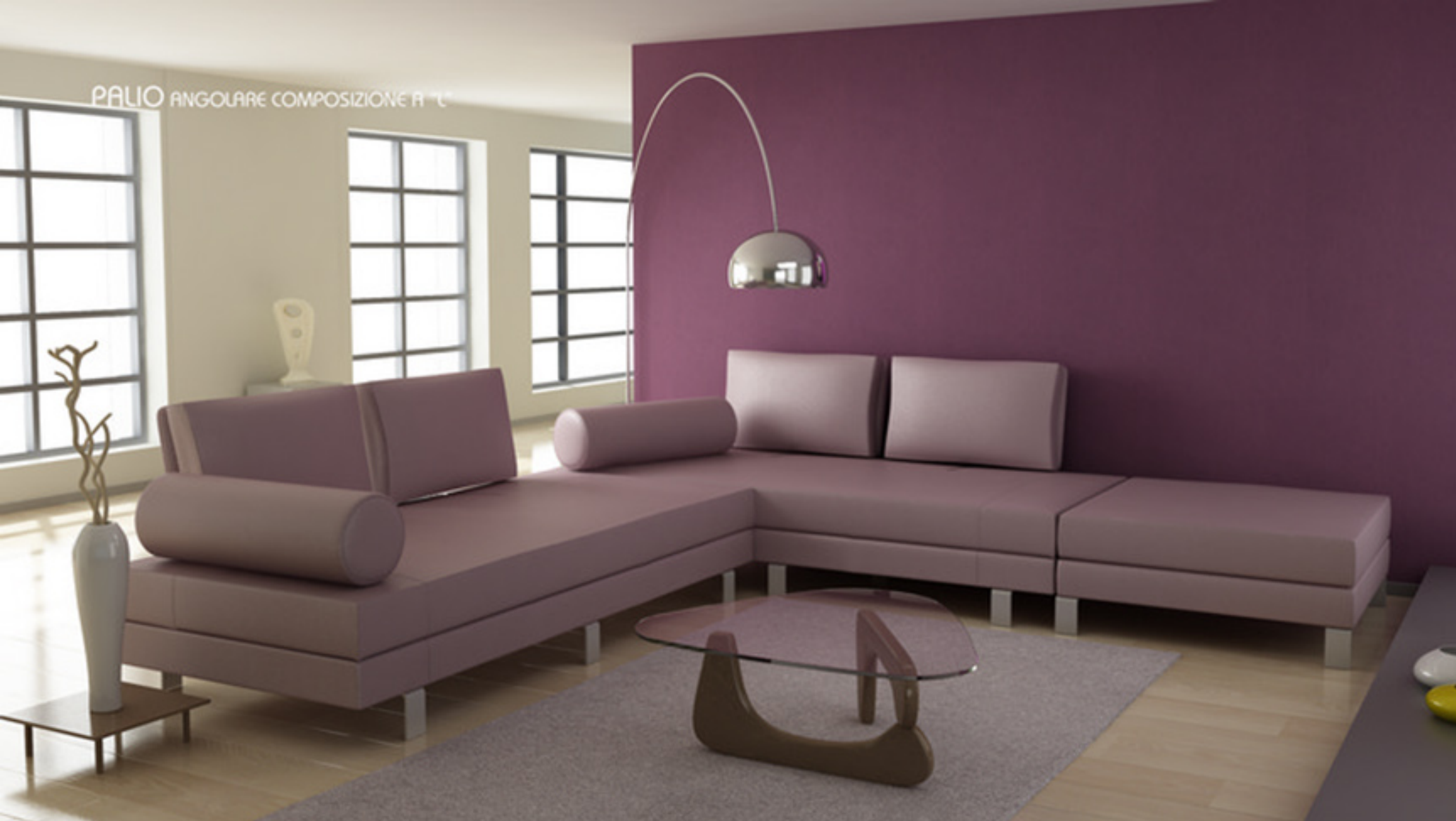
PALIO ANGOLARE COMPOSIZIONE A "U"