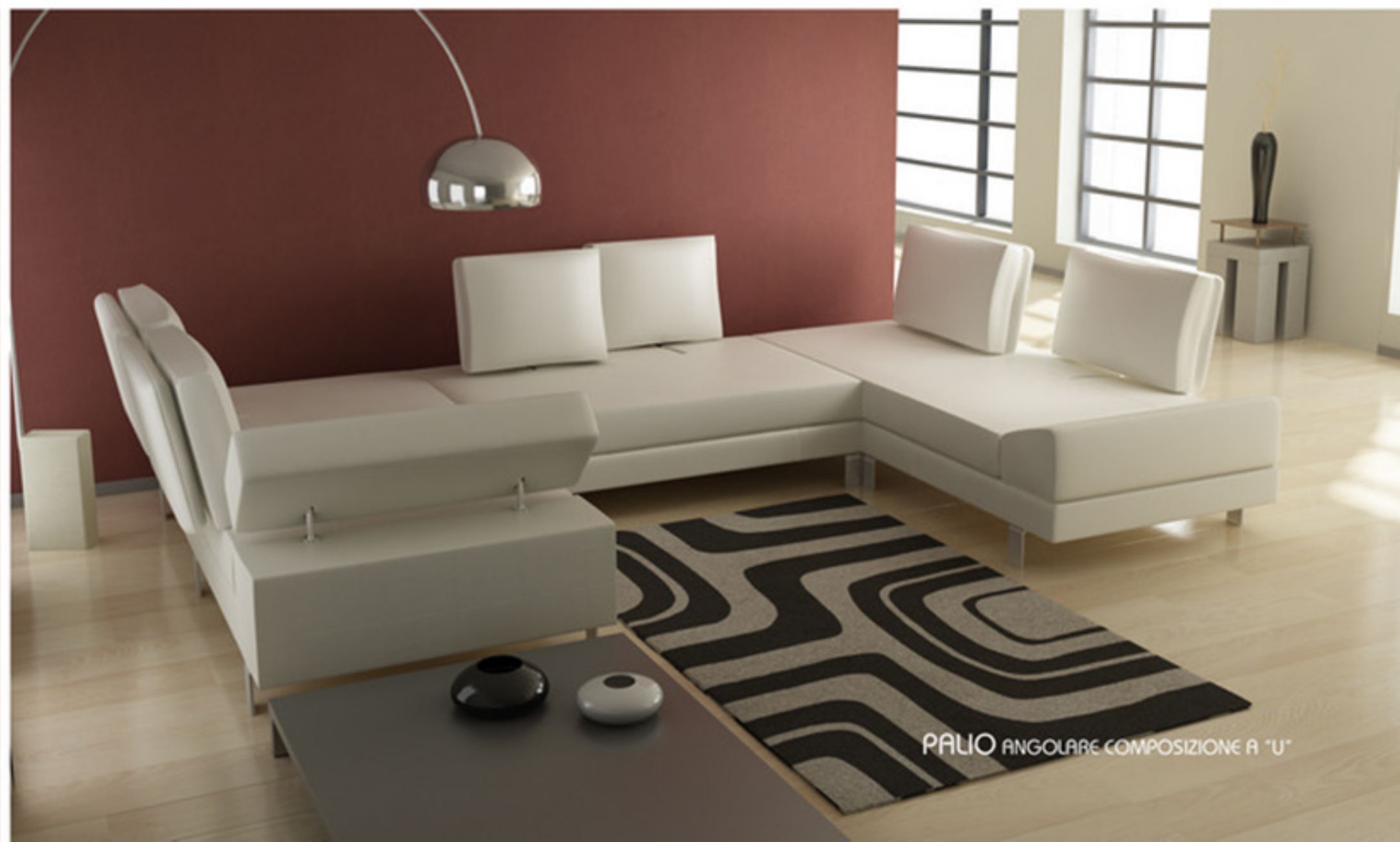
PALIO ANGOLARE COMPOSIZIONE A "U"